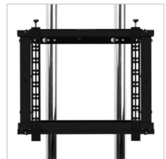
Compatible with B-Tech's collar and pole system for pole mounting screens