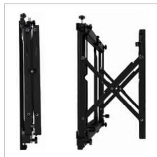
Pop-out system provides quick and easy service access