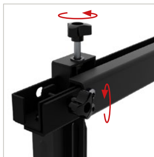
Tool less micro-adjustment for a seamless display alignment